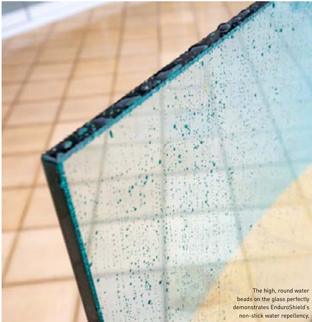
The high, round water beads on the glass perfectly demonstrates EnduroShield's non-stick water repellency.